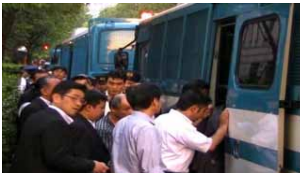
numerous police vehicles were deployed in advance to transport massive framed-up arrestees

On May 20, the Tokyo High Court was opened to decide on the issue of removal of the headquarter building of Sanrizuka Farmers' Opposition League on the adjoining spot to the airport runway, demanded by the Narita International Airport Corporation (NAA). The Chiba District Court had recently ruled the case in favor of the NAA and Sanrizuka farmers had appealed to the Tokyo High Court. Numerous concerned people gathered to attend the court judgment.