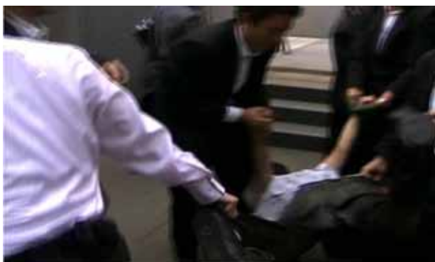
Police brutality in the High Court