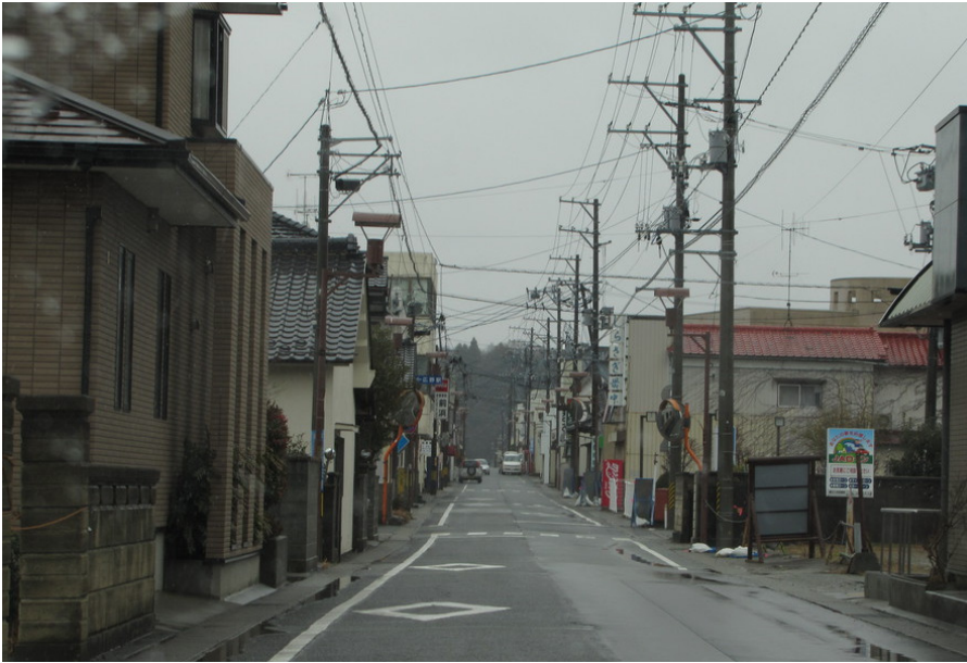
Virtually no traffic on the mainstreet of Hirono since March last year

thing the management is doing is equipping workers with integrating dosimeters. They have evidently no interest in caring for the safety and security of their employees.