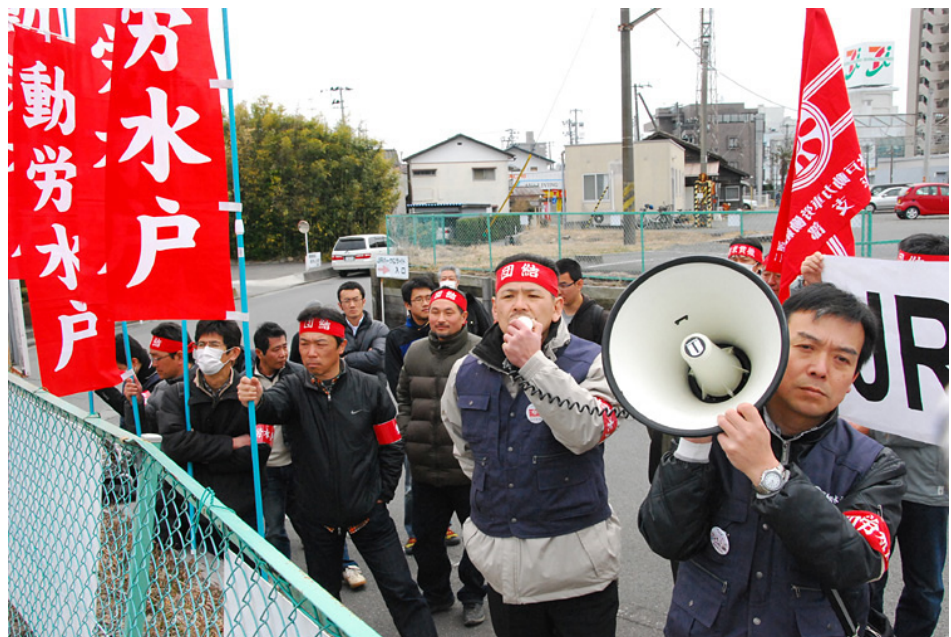
Doro-Mito Strikes on March 23

She put forward her demand to the chief of the District Operation Center, "It is terrifying. I want to have babies in future. I don't want to work on the train to Hirono." But the chief flatly refused, "Don't be selfish! The company isn't ready to give you special treatment." Is it selfish of her to say that she