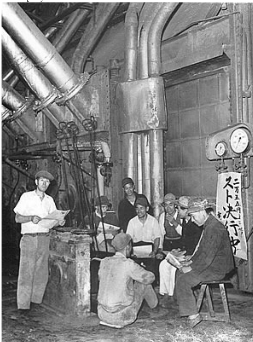
Electrical workers on strike in Tsurumi Thermal Power Plant, September 1952

undermined and destroyed the labor right and unity of workers in the name of capitals' "freedom", and demanded the abolition of regulation on capital's movement in quest of profit under the protection of the state power. Workers' right and social security system, which were obtained by class struggle in the post-war upheaval, became target of neo-liberal offensives due to the drastic policy change of Japanese imperialism in the last half of 1980'. Its aim