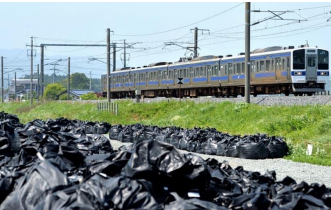
Test operation between Hirono Station and Tatsuta Station; innumerable radioactive waste in flexible container bags are piled up on lands adjacent to the rail truck.

As a result of these severe developments, the