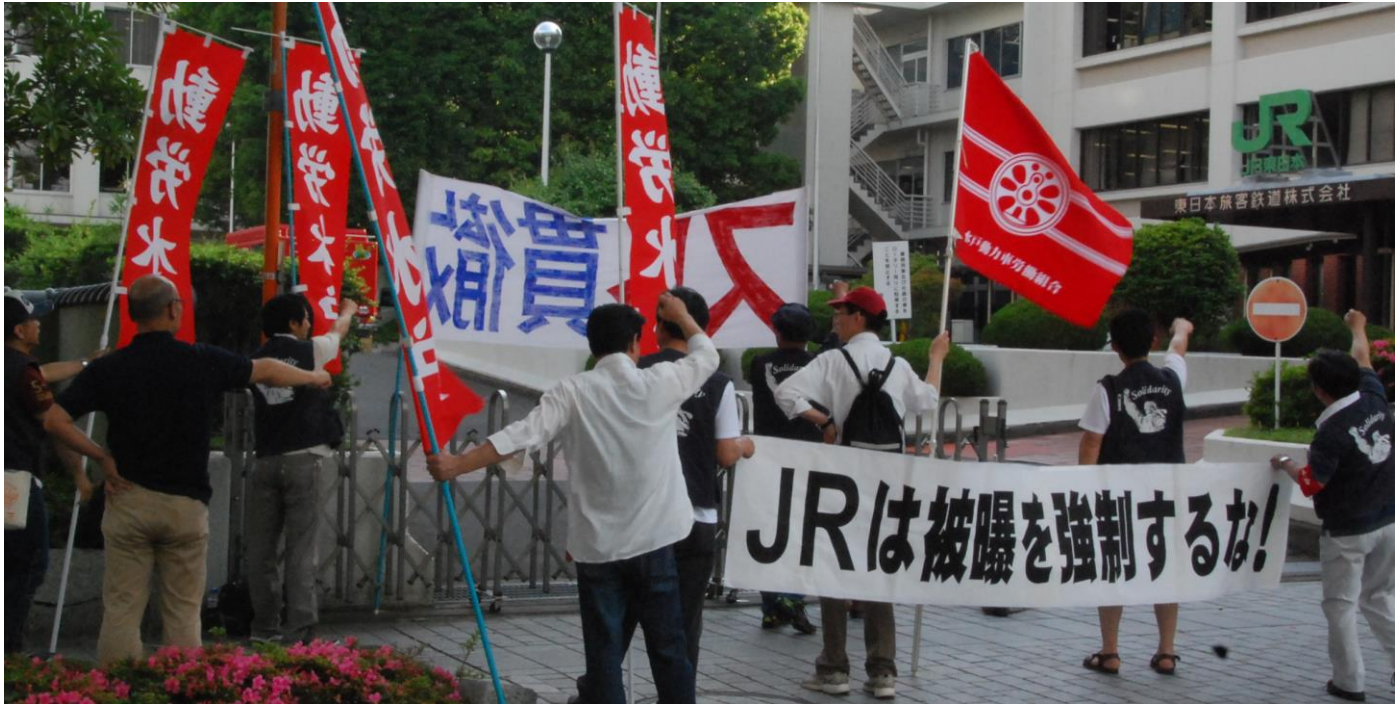
Striking Doro-Mito members (May 31, in front of Iwaki Transport Bureau of JR East)

Secretary General of National Conference for Worldwide Immediate Abolishment of All Nuclear Power Plants (NAZEN)