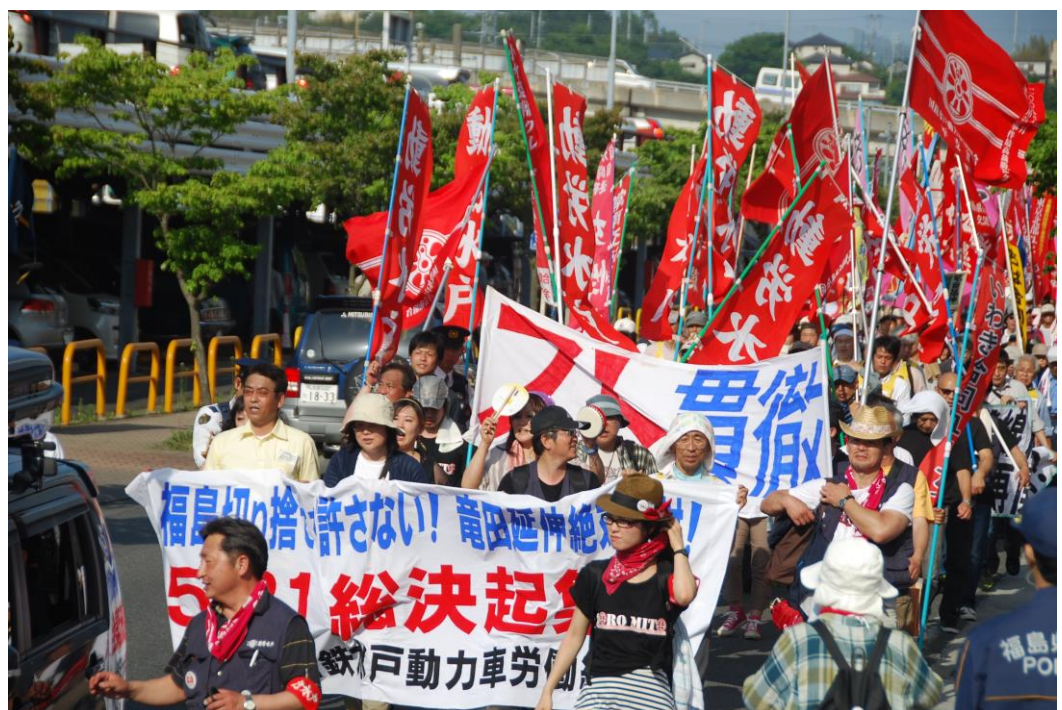
Doro-Mito, Doro-Chiba and their supporters march in Iwaki City (May 31)

truck between Hirono Station and Tatsuta Station, 16 kilometer (10 miles) from the Fukushima Daiichi NPP. On Monday June 1, it extended “commercial” service to the